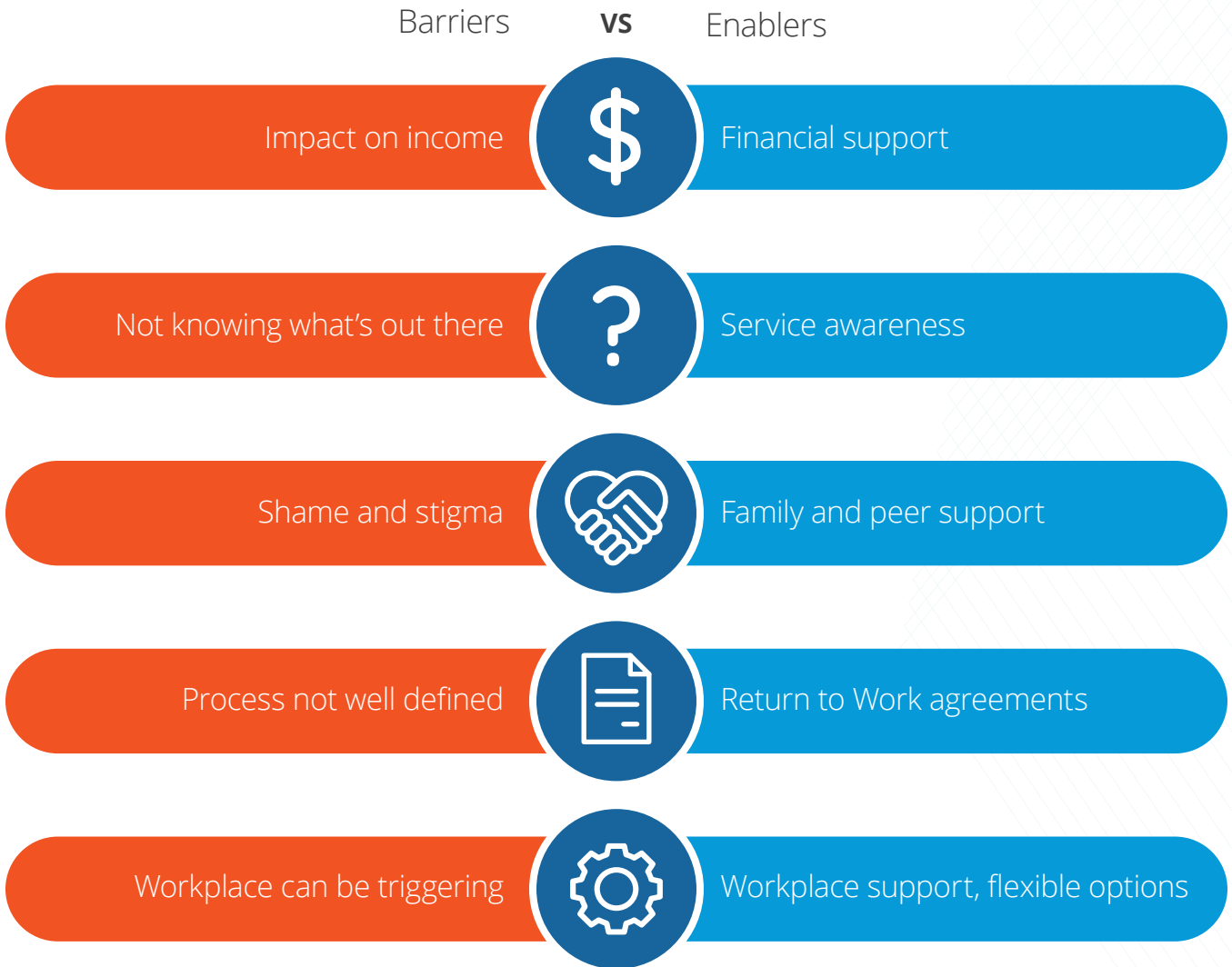
FIGURE 3: Barriers and Enablers to Return to Work for those with Mental Illness and Substance Use Issues